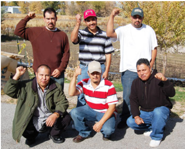
Workers at the Hyrum JBS/Swift plant voted overwhelmingly to join UFCW Local 711.

More than 1,100 workers at the JBS/Swift beef plant in Hyrum, Utah, have voted overwhelmingly to join the UFCW. Those workers will now become members of UFCW Local 711.