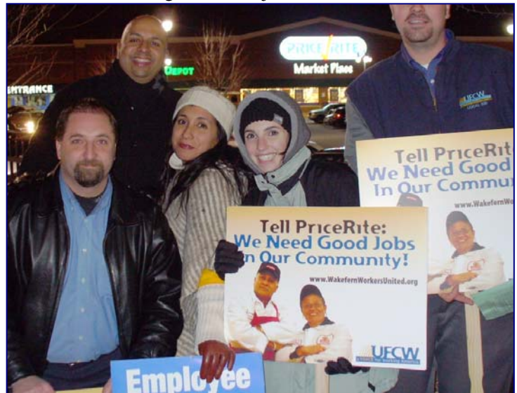
UFCW staff rallies with Jobs with Justice for PriceRite workers and Employee Free Choice

On December 18, the groups gathered to support workers at PriceRite stores who want to join a union, and to call for passage of the Employee Free Choice Act. The rally was intended to help community members understand that the foundation of a strong economy is its workers, and that good union jobs are essential to